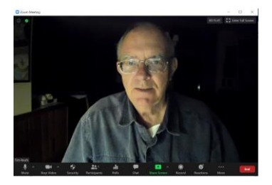
Live Chat is optional.