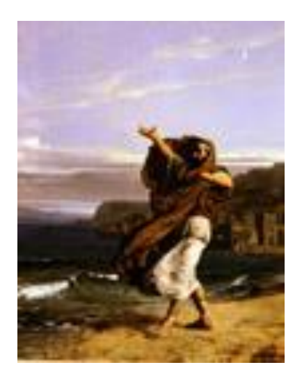
<u>Demosthenes Practising Oratory</u>(1870) <u>Jean-Jules-Antoine Lecomte du Nouÿ</u>(1842–1923) Wikipedia

REM: Your Term Paper is due next week . . .